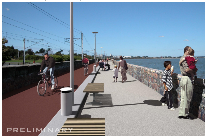
S2S proposals include pedestrian and cycleway on top of flood defenses, connecting the community with Dublin Bay

S2S Solutions for coastal protection that also enhance the public amenity